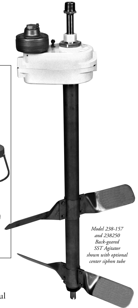
Model 238-157 and 238250 Back-geared SST Agitator shown with optional center siphon tube

Graco let the customer define this new drum agitator. With its full-width blades, this powerful agitator quickly and gently mixes fluids, minimizing leftover sediment at the bottom of the container. More importantly, it maintains the integrity of the fluid to assure optimum quality standards.