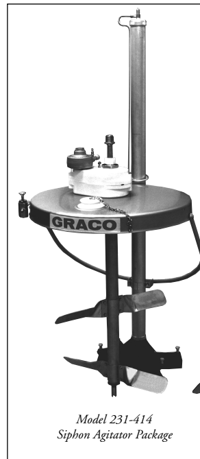
Model 231-414 Siphon Agitator Package